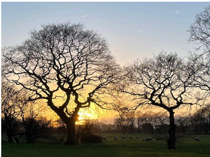
If you look closely you can see the sheep in the field!